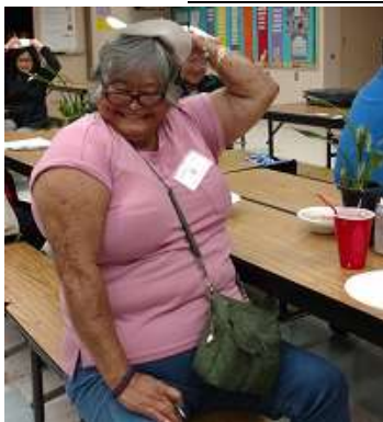
A Few of the Events from our Potluck in December

Mailing address: Kunia Orchid Society PO Box 893956 Mililani, HI 96789